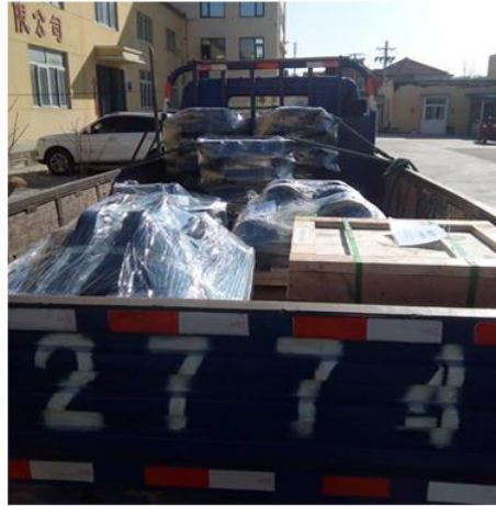
Parts are delivered to Port