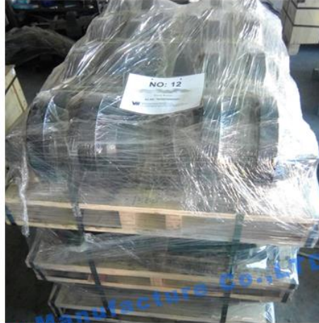
Each Pallet Covered With Thin Film and Sticker