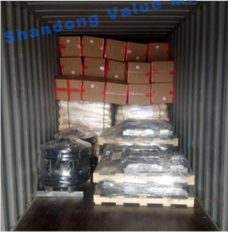
Parts in the Container