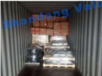
Parts in the Container