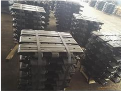
20pcs or 22pcs Track Shoes Each Pallet