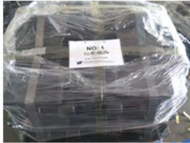
Each Pallet Covered With Thin Film and Sticker