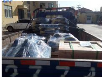
Parts are delivered to Port