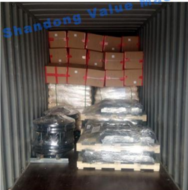
Parts in the Container