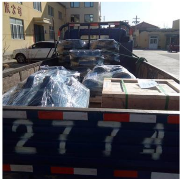
Parts are delivered to Port