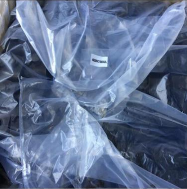
2 sets Drive Chains are packed in One Plywood Crate